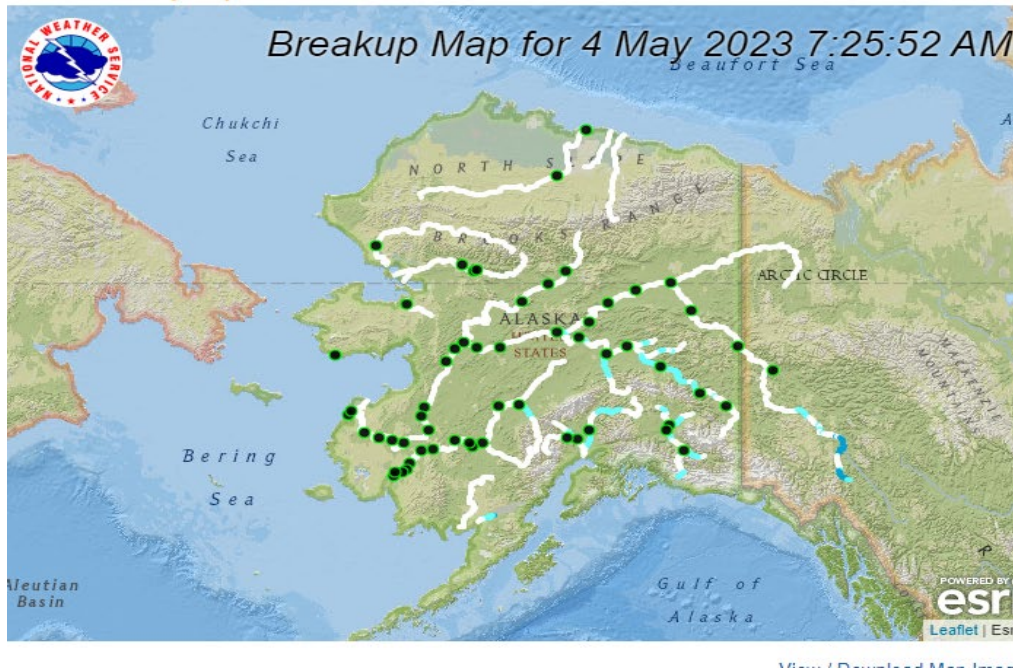
APRFC Breakup Map

This map allows you to view the breakup status of major rivers. Click a site for more breakup information.